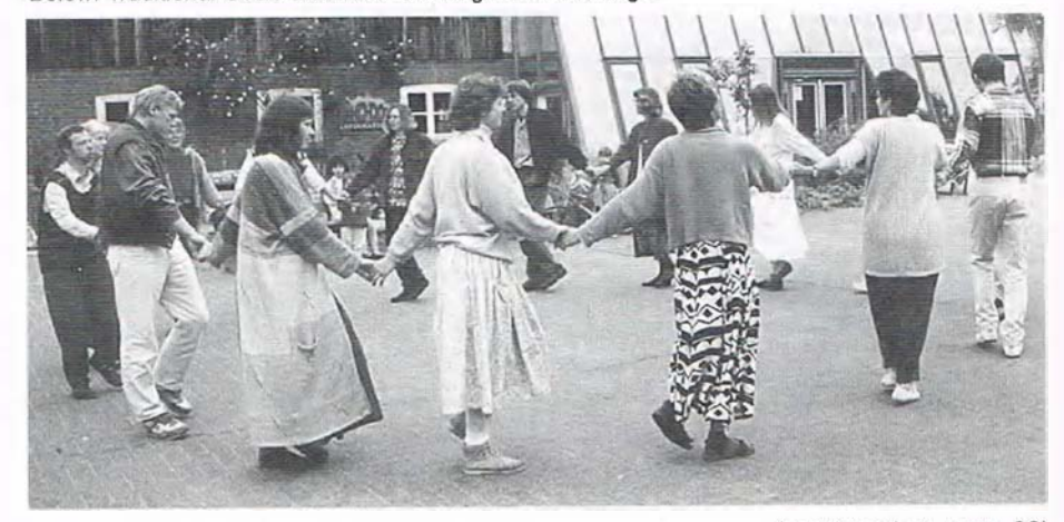
(continued on page 38)

Below: Traditional Circle Dance at Lebensgarten Ecovillage